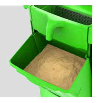
Easy to reach collection Ergonomic sifting trav > Eases the access to the